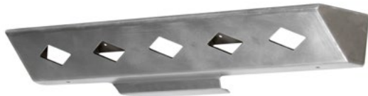
0124-32101 Fly Offroad Front Skid Plate for Jeep Wrangler JK & JKU

These installations instructions apply to the following Fly Offroad products: