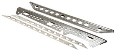
0124-26301 Fly Offroad Rock Sliders for Jeep Wrangler JKU Only

These installations instructions apply to the following Fly Offroad products: