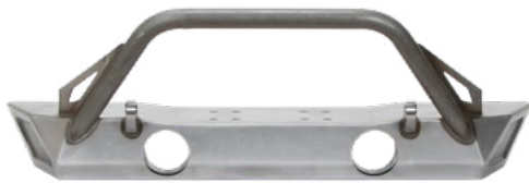
0124-12101 Fly Offroad Front Bumper for Jeep Wrangler JK/JKU, JL/JLU, and Gladiator JT

These installations instructions apply to the following Fly Offroad products: