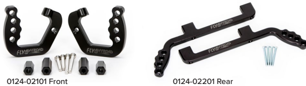
0124-02101 Crawl Claw Grab Handles, Front 0124-02201 Crawl Claw Grab Handles, Rear

These installations instructions apply to the following Fly Offroad products: