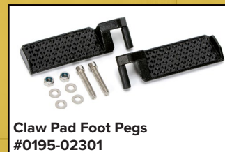
Claw Pad Foot Pegs #0195-02301